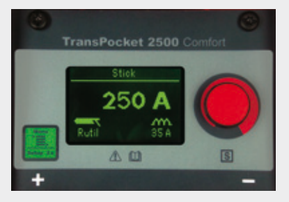
/ Easy menu navigation and plain-text display. Job Mode stores individual settings. Synergic Mode optimises welding parameters for freely selectable types and diameters of electrode.