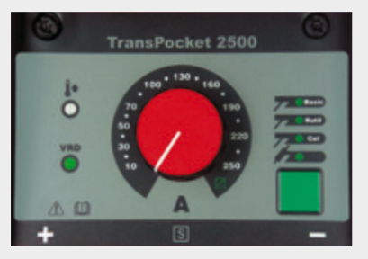
/ Manual electrode welding and extra TIG function. Large rotary knob for ease of operation even when wearing gloves.