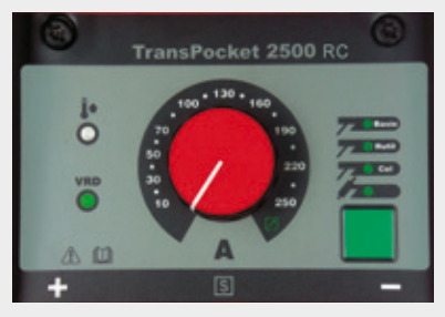
/ E-manual welding and TIG additional function, also remote control interface for direct on-site control.