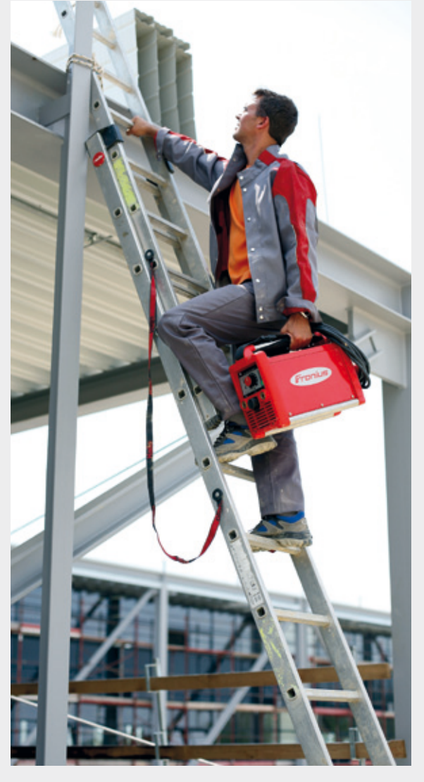
/Lightweight and portable, and so right at home on every worksite.