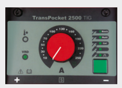
/ Manual electrode and perfect TIG welding with the TIG pulsed-arc function, for immaculate welds. Also features gas solenoid valve and remote-control connection.