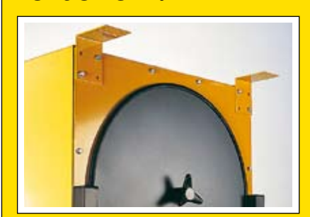
Flexible mounting options allow the Smart"One" to be mounted from the ceiling, wall or floor.