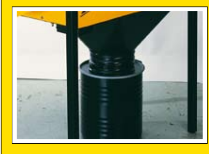
Smart"One" includes a 60° incline dust transport hopper and dust drum.